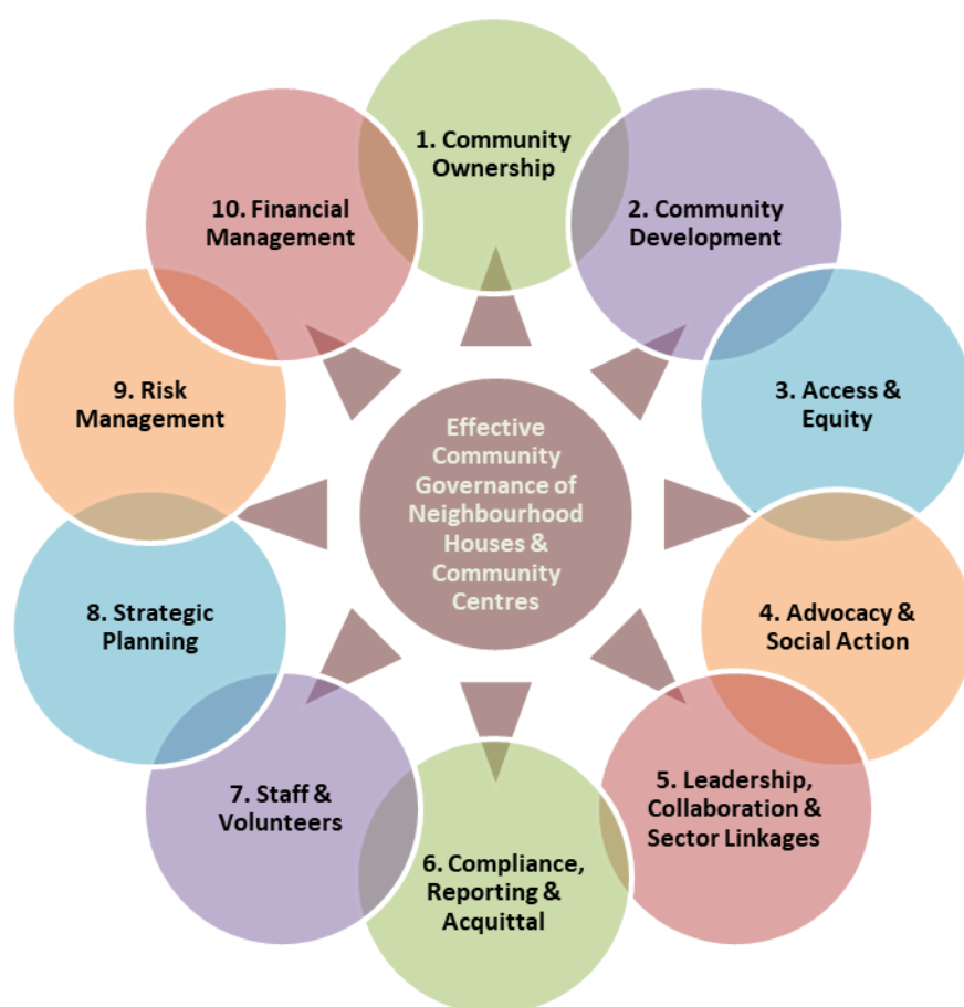
Figure 1: Taken from the Network West Governance Project 2013