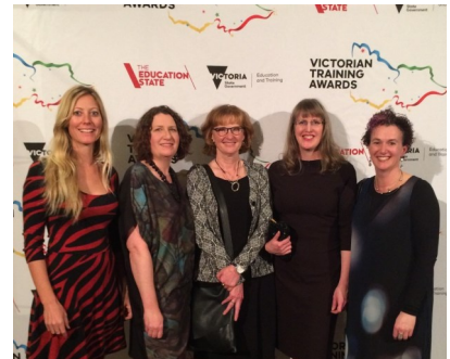
Kensington Neighbourhood House Team

Apologies for missing out on any other Awards given in 2016-2017!