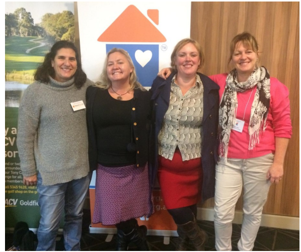
Network West Networkers across the decades!

There was also a reunion of Networkers from Network West spanning two decades!