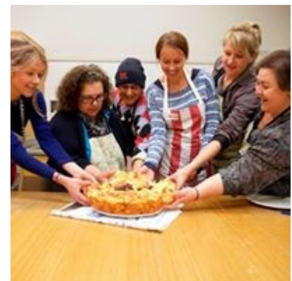
Yarraville Community Centre's winning photo in the NHVIC Photo Competition